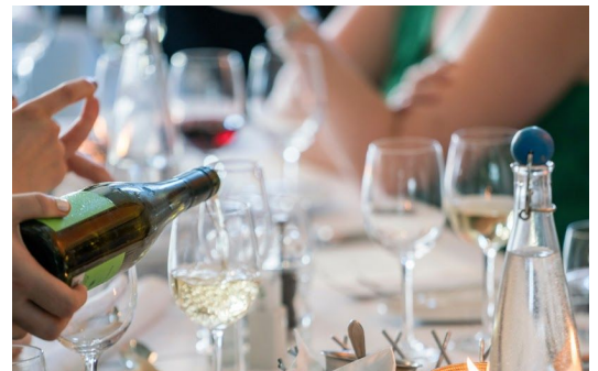
Host or Server