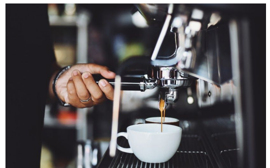
Barista or Cafe Worker