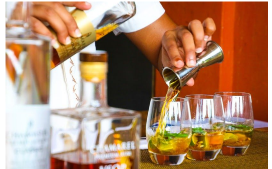
Bartender or Barback